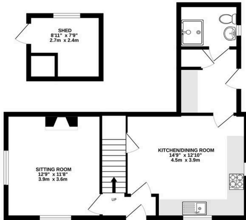
GROUND FLOOR 538 sq.ft. (50.0 sq.m.) approx.