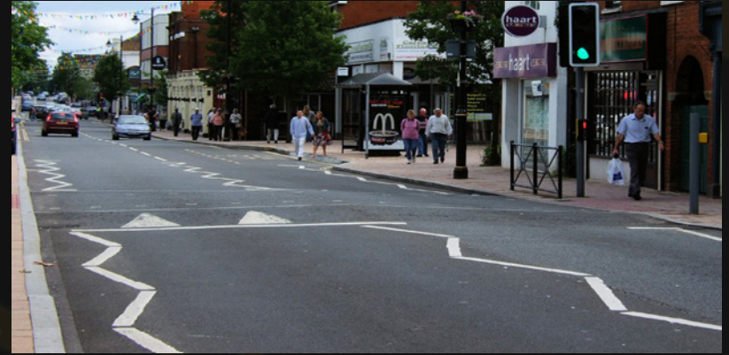
Fleet High Street