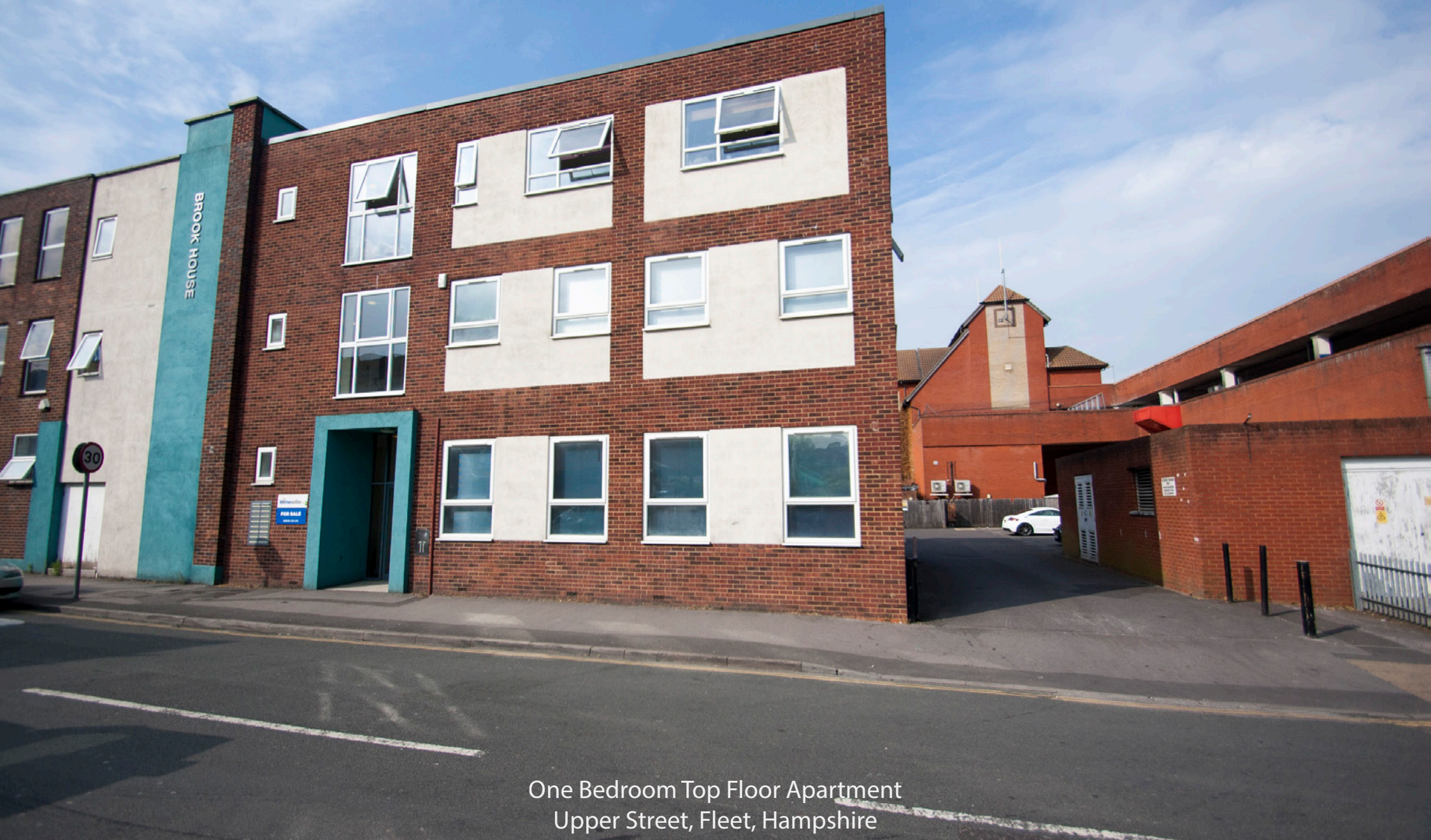
One Bedroom Top Floor Apartment Upper Street, Fleet, Hampshire