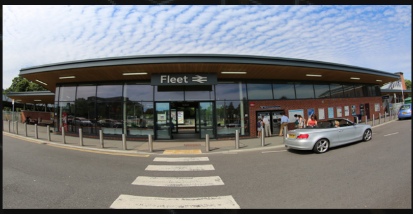
Fleet Mainline Railway Station