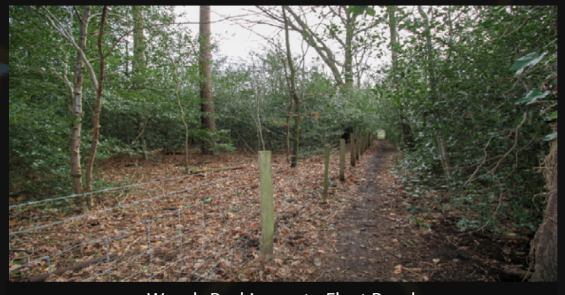
Woods Backing onto Fleet Pond