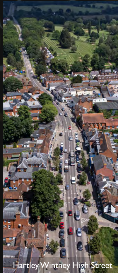
Hartley Wintney High Street