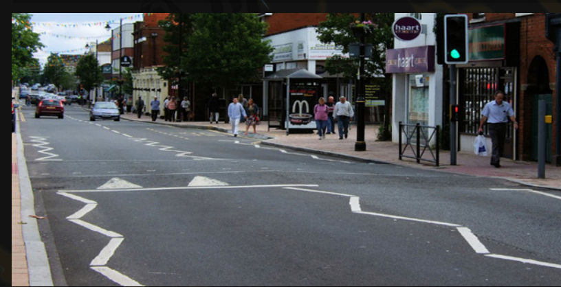
Fleet High Street