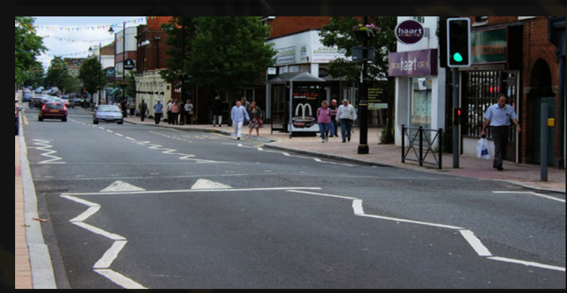
Fleet High Street