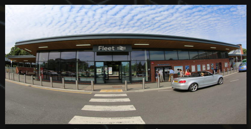
Fleet Mainline Railway Station