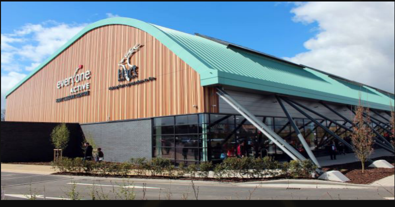
Hart Leisure Centre