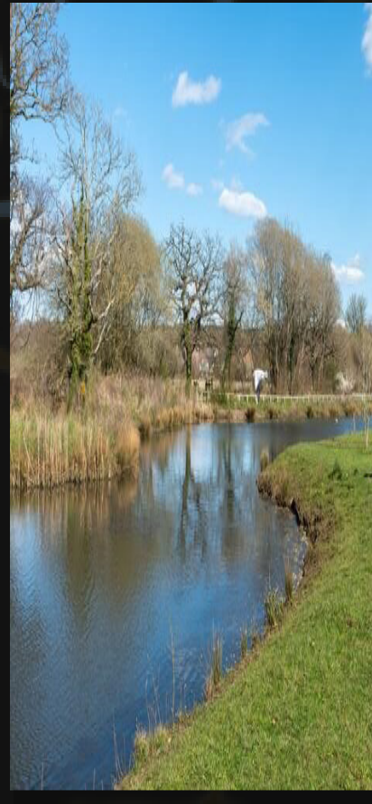
Edenbrook Country Park