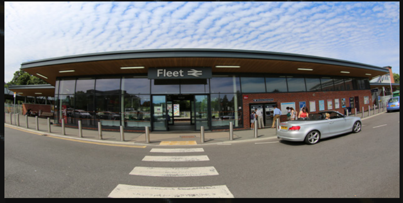
Fleet Mainline Railway Station