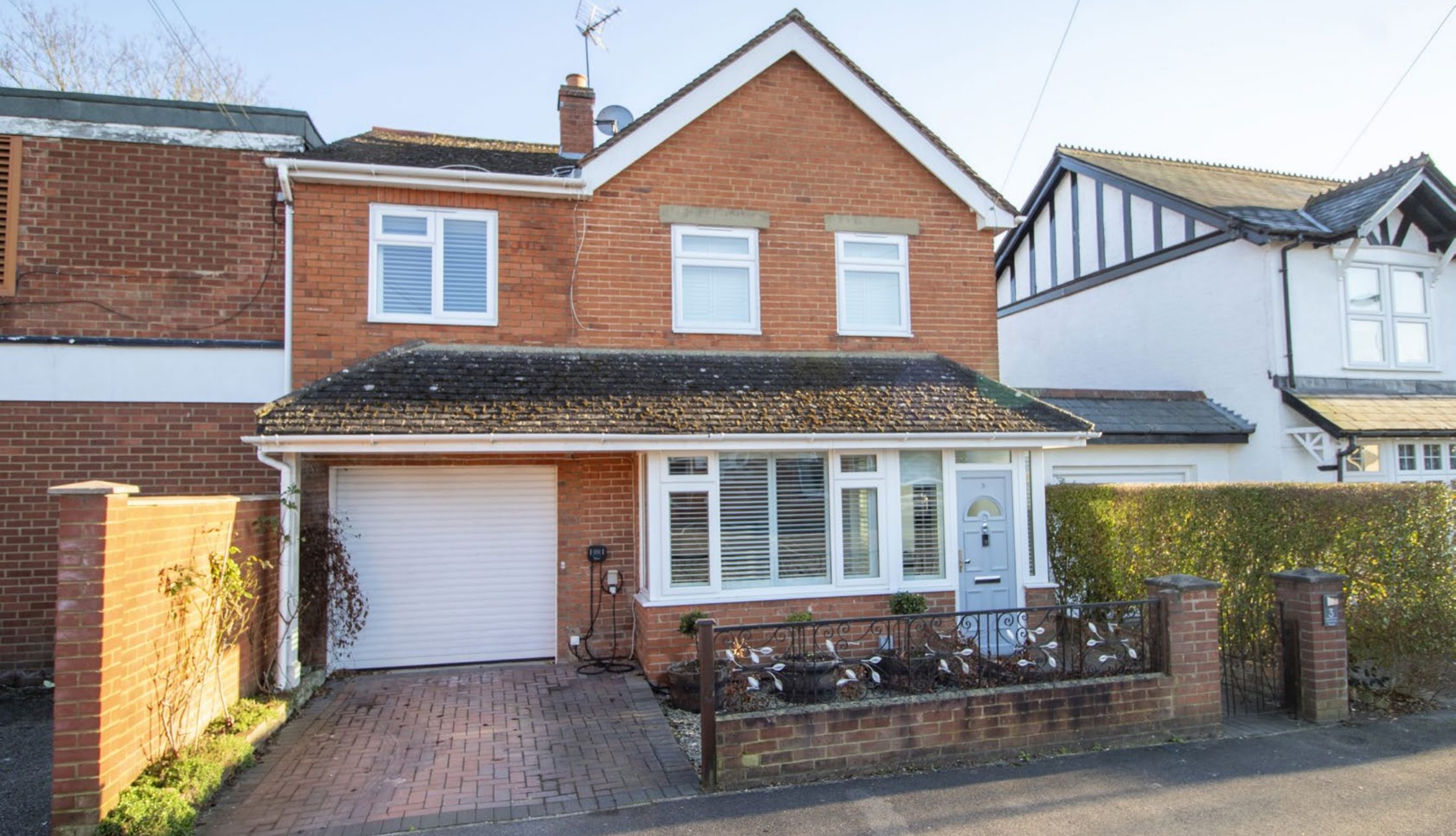
Four Bedroom Detached Property Clarence Road, Fleet, GU51 3RZ