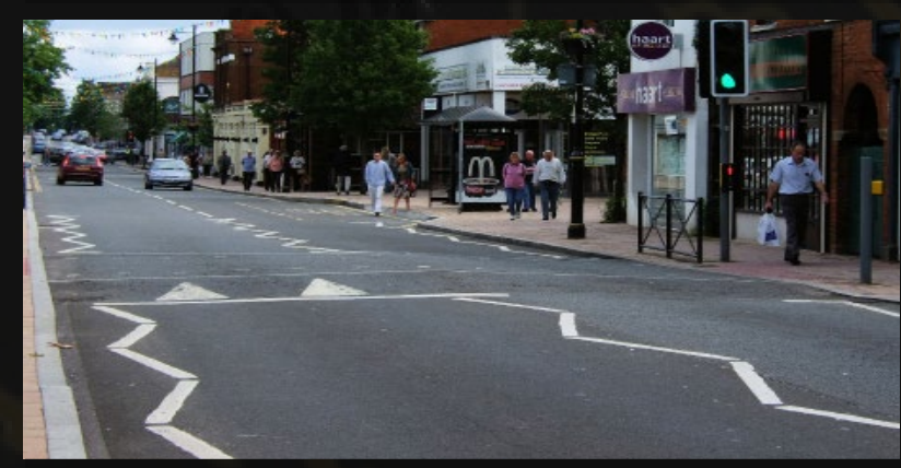
Fleet High Street