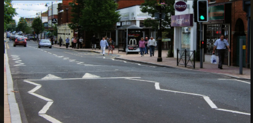
Fleet High Street