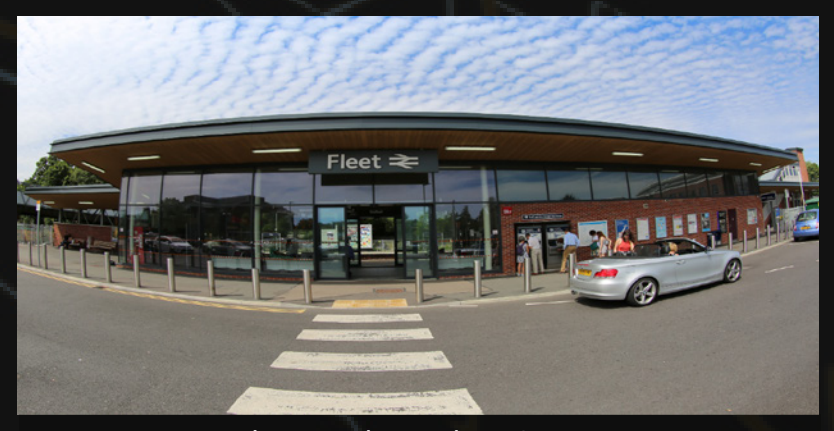
Fleet Mainline Railway Station