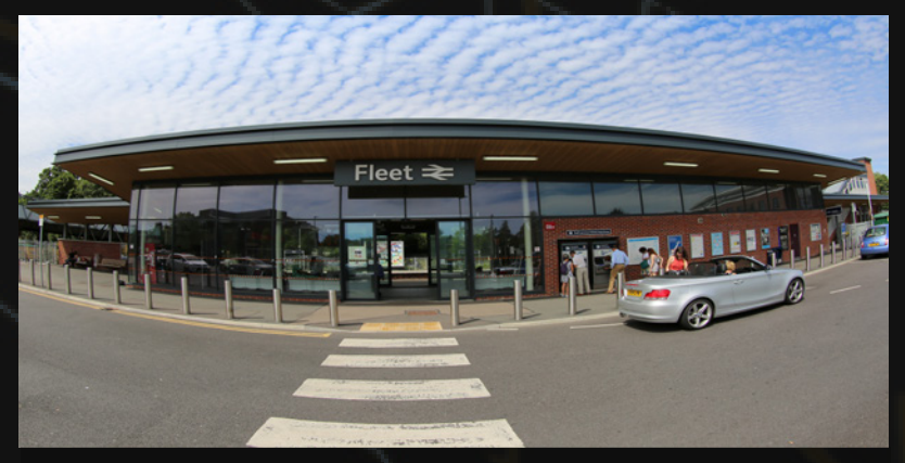
Fleet Mainline Railway Station