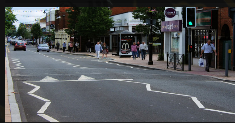
Fleet High Street