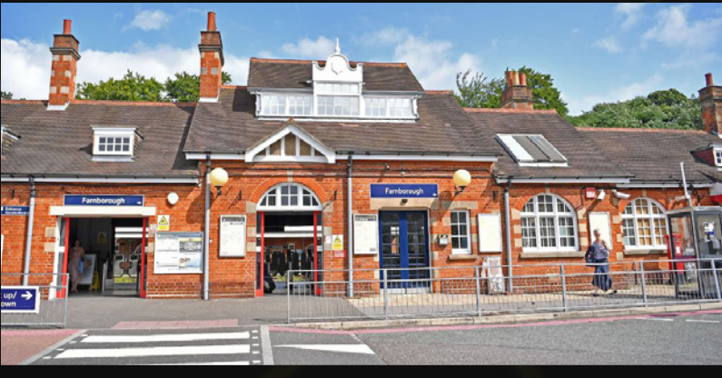
Farnborough Mainline Railway Station