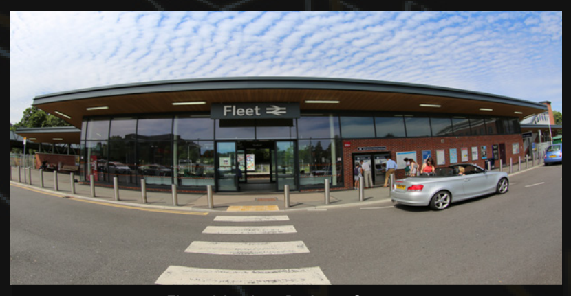
Fleet Mainline Railway Station