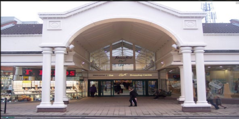
Hart Shopping Centre

The villages of Hartley Wintney and Odiham plus the attractive market town of Farnham are all within a six mile drive.