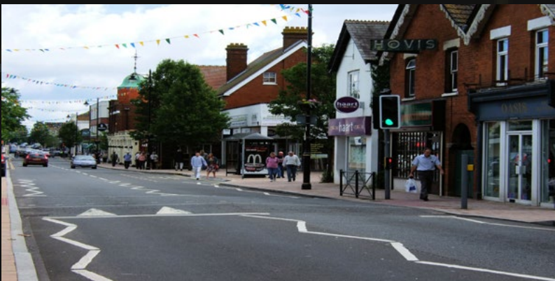
Fleet High Street