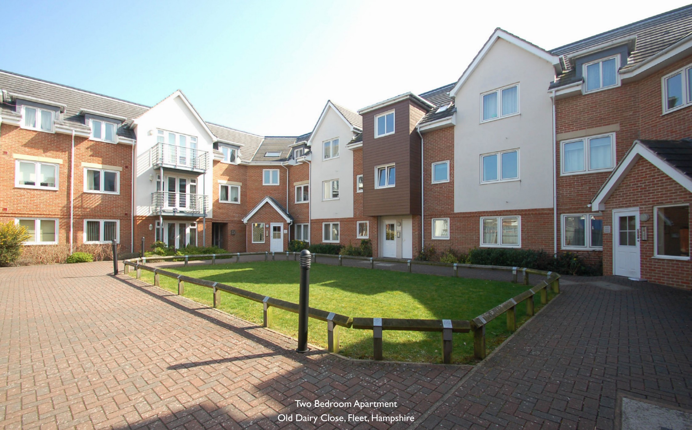
Two Bedroom Apartment Old Dairy Close, Fleet, Hampshire