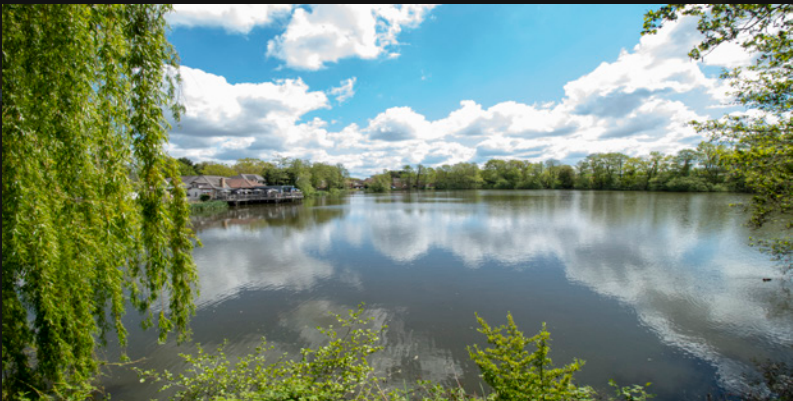
Fleet Pond/Nature Reserve