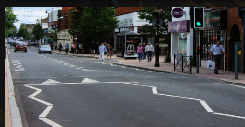
Fleet High Street