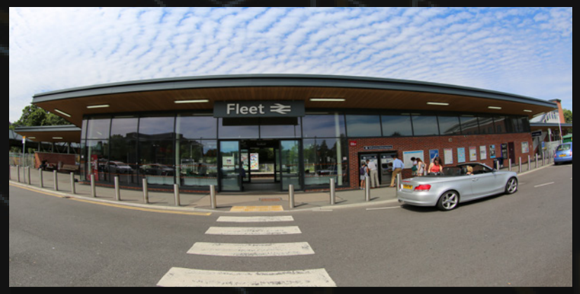
Fleet Mainline Railway Station